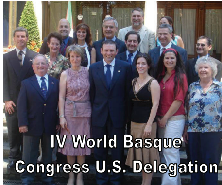
IV World Basque Congress U.S. Delegation