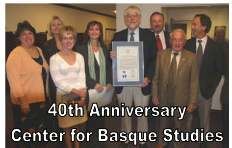
40th Anniversary Center for Basque Studies

These new clubhouses can now be found in Ontario, OR, Homedale and Mountain Home, ID. That now brings the total of NABO organizations with their own facility to twelve! One more member will also soon trade-up to a new facility: the Center for Basque Studies (UN Reno) which this year celebrates its 40th anniversary. Zorionak to all!